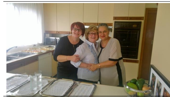
In the photos are some of the participants at the early stages of the gathering.