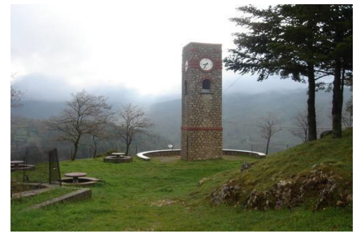
Karyes Community Clock